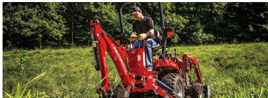
MF GC1723 E | 22.5 HP

Designed to help you get a wide variety of jobs done, this tractor is not too big, not too small. Plus, it has the versatility and ease of use to handle every chore.