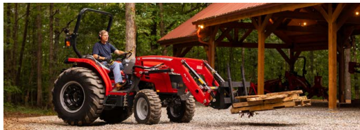
MF 1835 M | 36.2 HP

Designed to help you get a wide variety of jobs done, this tractor is not too big, not too small. Plus, it has the versatility and ease of use to handle every chore.