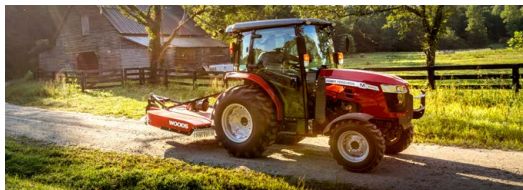
MF 2860 M | 60.3 HP

Get more work done in a day with a tractor that has the versatility and durability to handle any task you throw at it.