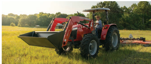
MF 4708 | 24.8 HP

Meet every demand of your farm with this multi-functional workhorse. For every tough job, this is the tractor that does it right.